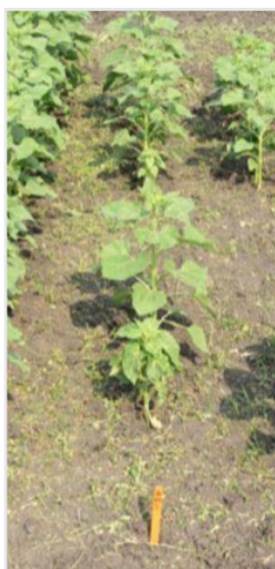
Untreated — 50% incidence